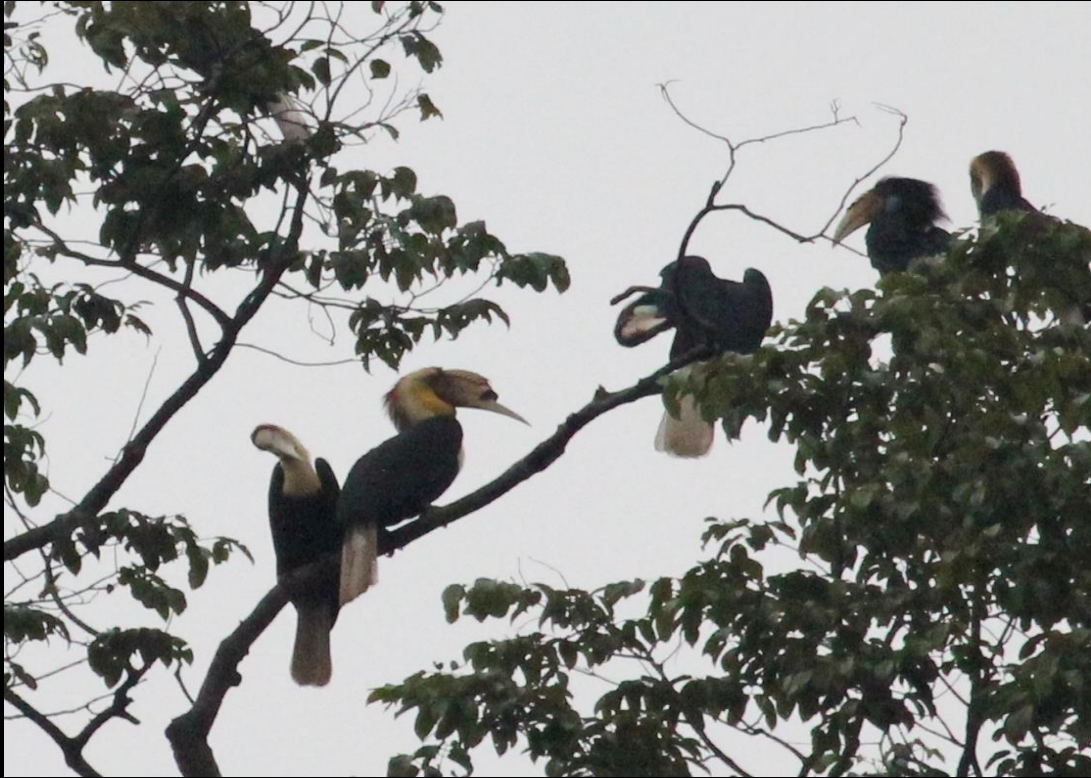
“Half-Beak”, a male Plain-pouched Hornbill with a missing (part) upper mandible observed near Kg Chuweh. A first case reported from the wild (Top). A pair of Plain-pouched Hornbills in flight (Bottom).