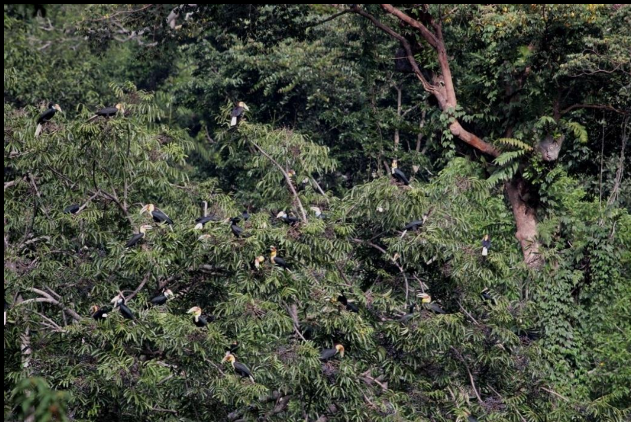
Plain-pouched Hornbills feeding on the 'piwar' fruit in Temengor in September 2013.