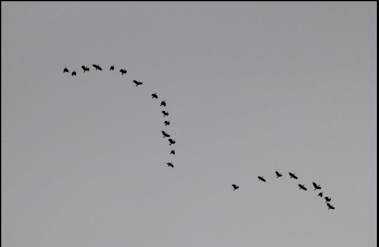
The flight formations of Plain-pouched Hornbills. Some fly close to the ridge tops, challenging volunteers to spot and count them accurately.