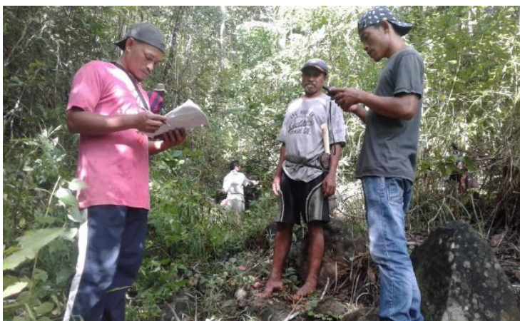
Community-based Monitoring in Desa Watu Panggal village