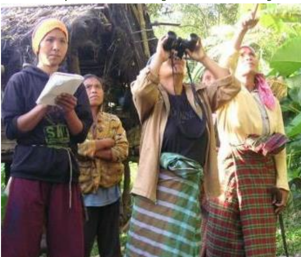
Community-based Monitoring in Golo Damu village